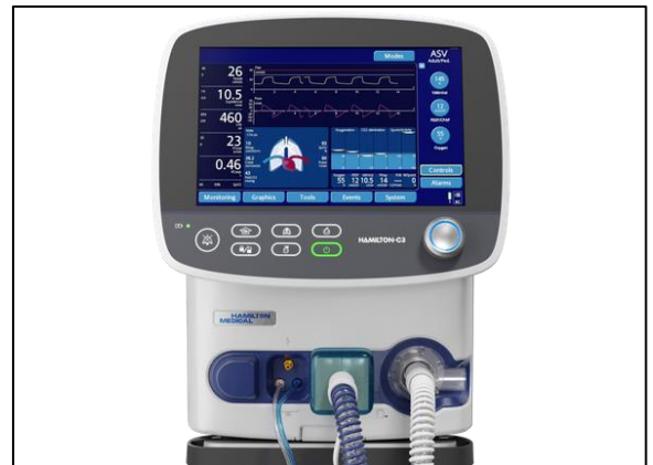
Example Ventilator

"Thanks to Angst+Pfister Sensors and Power, we were able to massively improve our process stability and repeatability"