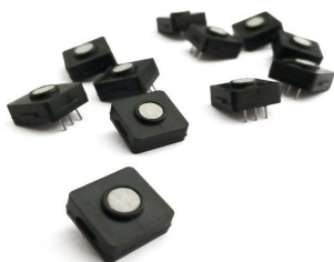
Solid Polymer Technology