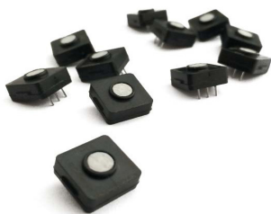
Solid Polymer Technology