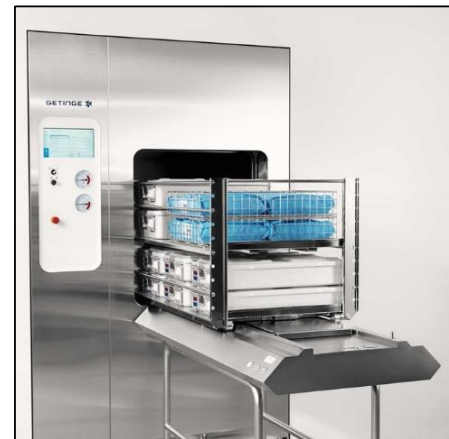
Example Sterilizer

"Thanks to Angst+Pfister Sensors and Power, we were able to massively improve our process stability and repeatability"